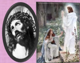
Christ Death and Resurrection